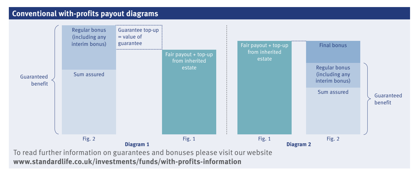
Diagram 1, Fig 1 shows the fair payout, it assumes we are paying a top-up from the inherited estate. This is the value we will pay unless the guaranteed benefit is higher and a guarantee applies to the payout. Fig 2 shows what we will pay if the guaranteed benefit is higher than the amount in Fig 1 and a guarantee applies to the payout. You can see that we would top up the fair payout but there wouldn't be any final bonus.

The height of the boxes does not indicate the relative size of each element of the with-profits payout.