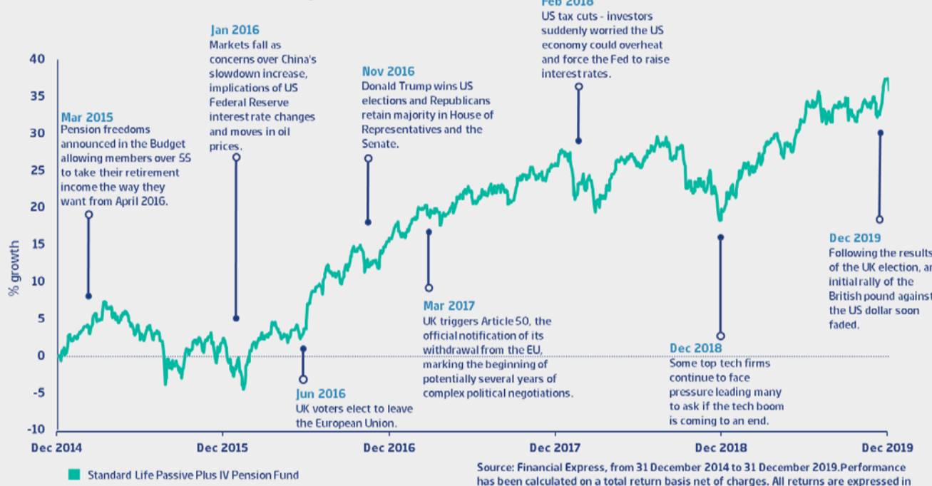
Source: Financial Express, from 31 December 2014 to 31 December 2019. Performance has been calculated on a total return basis net of charges. All returns are expressed in GBP terms.

The chart above shows performance over the full five years. The table below shows individual 12-month periods.