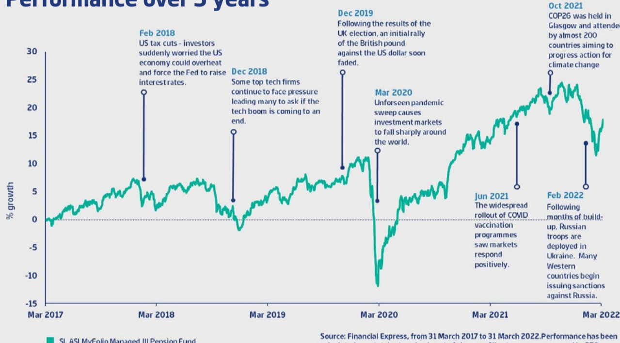
Source: Financial Express, from 31 March 2017 to 31 March 2022. Performance has been calculated on a total return basis net of charges. All returns are expressed in GBP terms.

The chart above shows performance over the full five years. The table below shows individual 12-month periods.