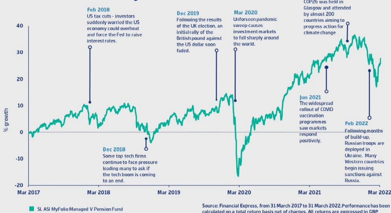
Source: Financial Express, from 31 March 2017 to 31 March 2022. Performance has been calculated on a total return basis net of charges. All returns are expressed in GBP terms.

The chart above shows performance over the full five years. The table below shows individual 12-month periods.